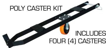
INCLUDES FOUR (4) CASTERS