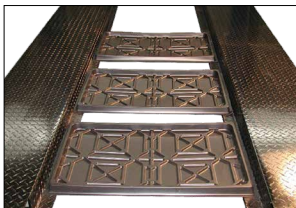
FOUR (4) DRIP TRAYS